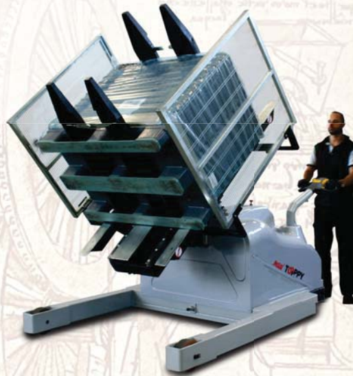
*wide base version

Topy Ph Advance is an electrical pallet truck used to change the pallets for various applications. It is equipped with linear guides and gel battery, and thanks to the special system adopted, it doesn't require big pressure on the load, so the pallet replacement can take place in a simple, quick and safe way. Topy Ph Advance is the pallet turner used in several fields of application as pharmaceutical, food, cosmetic and for various other products like bags, boxes, phials, bottles, big bags and cans.