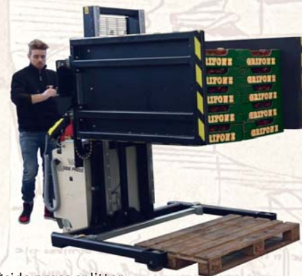
*side press splitter